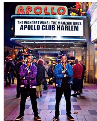
1989-2014 6 Time Apollo Amateur Night Champions; -Record 16 Apollo Stage Appearances