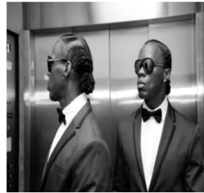
2026 State Senate Citation, Hip-Hop Pioneers