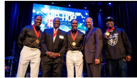
2025 Berklee Hip-Hop Hall of Fame Induction