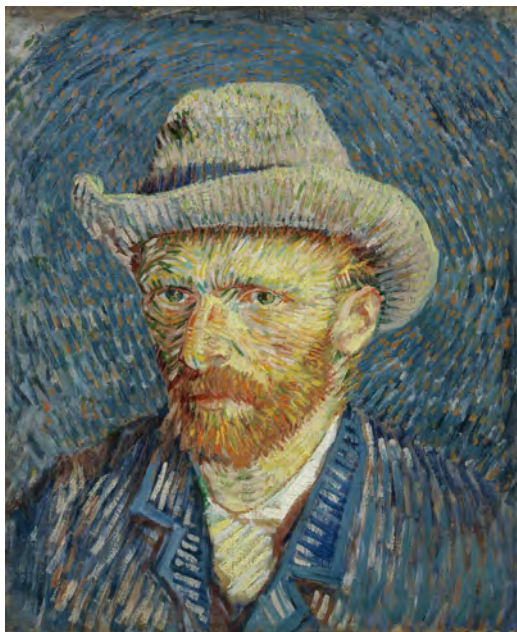
VINCENT VAN GOGH