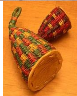
Shekere & Kесеke

The Djembe Drum: A djembe or jembe ( /ˈdʒɛmbeɪ/ JEM-bay ; from Malinke jembe [dʲěbe] [1] ) is a rope-tuned skin-covered goblet drum played with bare hands, originally from West Africa . According to the Bambara people in Mali , the name of the djembe comes from the saying "Anke djé, anke bé" which translates to "everyone gather together in peace" and defines the drum's purpose. In the Bambara language , "djé" is the verb for "gather" and "bé" translates as "peace." [2]