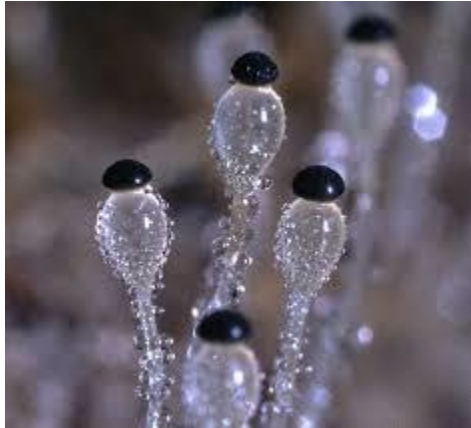
image of Pilobolus Crystallinus fungus

Fabulous Youtube of the (poo loving) fungus in action: